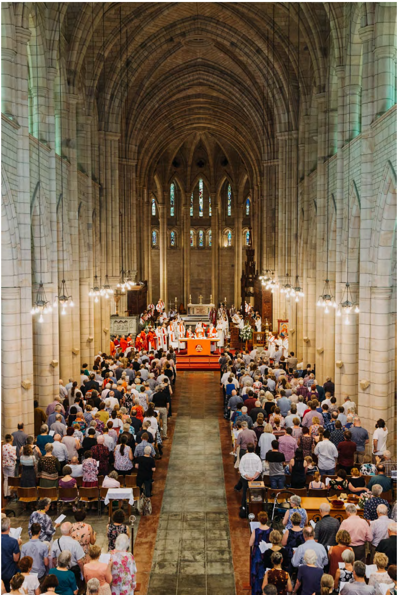
The 2018 Ordination Service