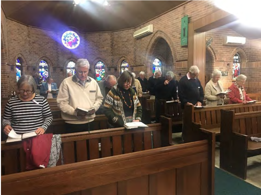
Image: Holy Trinity Anglican Church, Goondiwindi